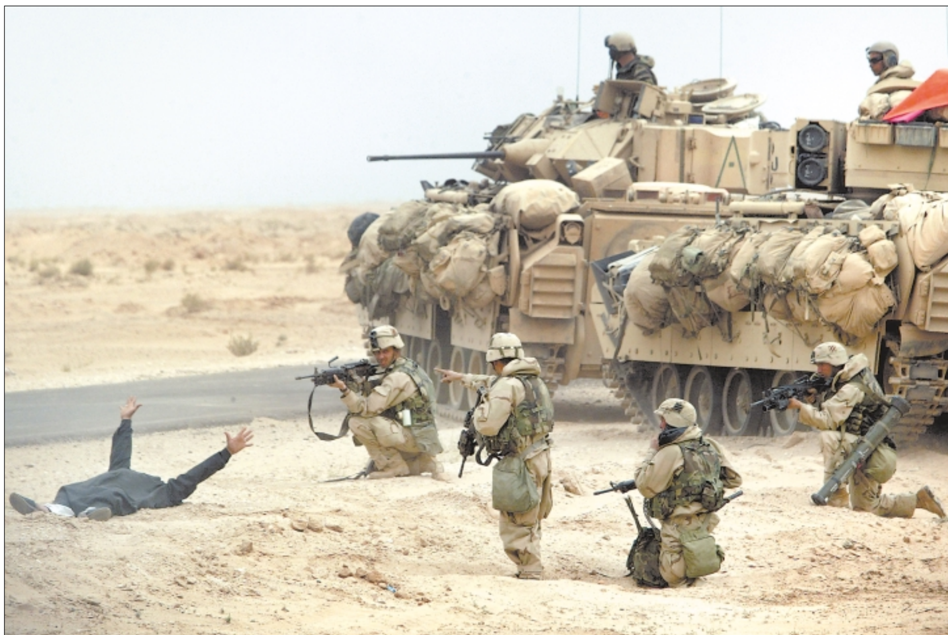
■ Soldiers of the 3rd Armored Brigade Combat Team, 3rd Infantry Division, from Fort Benning, Ga., surround a man who was stopped for suspicious activity Monday at an undisclosed location in southern Iraq. An AK-47 automatic rifle and ammunition were found in the man's vehicle.