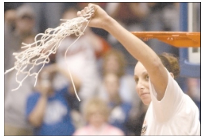
UConn's Diana Taurasi displays the net to her teammates following the Huskies' 73-64 victory Tuesday over Purdue, which propelled them into the Final Four.