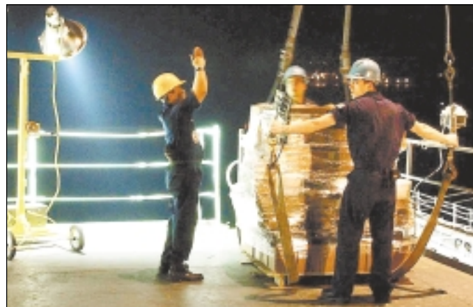
The deck crew of the USS Emory S. Land reload supplies during night operations in the eastern Mediterranean Sea on Monday.